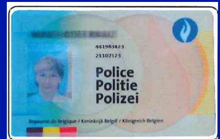
Belgian Police (Federal and Local)