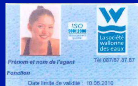
SDWE (Water Company)